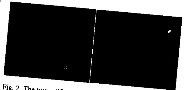
Fig. 2. The two artificial substrates utilized in this project as coral nurseries: A. Warren Modules, and B. DERM Modules.

suggested and approved by BC EPD. Both the Warren Modules and the DERM Modules were deployed in 2001 as mitigation for unrelated projects. Both modules are located at 13 m depth, approximately 350 m from each other on sand substrate offshore of and adjacent to the inner reef (Fig. 1). The Warren Modules are composed of 55 cm x 55 cm x 15 cm concrete blocks stacked in pyramid fashion (Fig. 2); three Warren Modules were used as the first coral nursery. The DERM Modules are a standard design used by Miami-Dade County Department of Environmental Resources Management (DERM) (PBS&J 1999). They are composed of 2.59 m x 1.52 m x 1.52 m concrete slabs, concrete culverts, and limestone boulders (Fig. 2), arranged in 5 sets of 6 modules each (PBS&J 2000). Thirteen DERM Modules have been and will continue to be used as the second coral nursery.